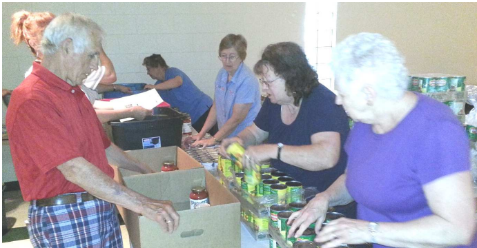
Trinity Volunteers support the Food Pantry at St. Vincent's Grove

To make an appointment with a professional counselor call toll free: 1-877-661-9623.